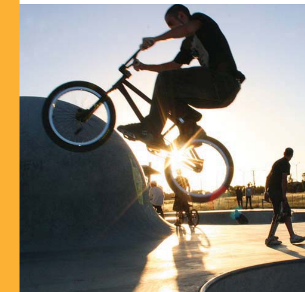
BMX riders and skaters are flocking to Gilbert Park, Knox's newest regional skating facility.

Skateboarders and BMX riders have rolled out in the thousands to try Knox's recently opened state-of-the-art skate facility at Gilbert Park.