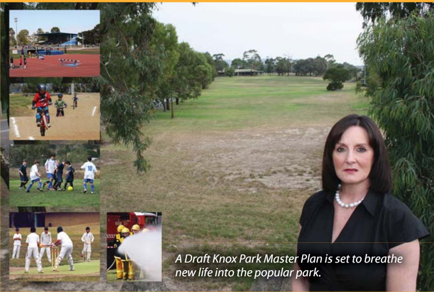
A Draft Knox Park Master Plan is set to breathe new life into the popular park.