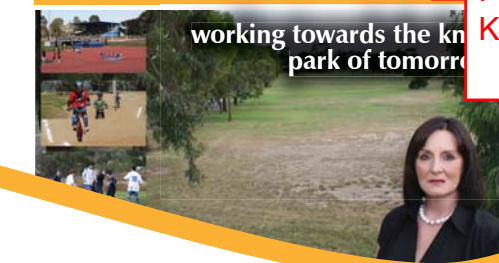
working towards the knox park of tomorrow

Please refer to: Knox Leader article 08-Jan-2008